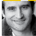
FAMILY SUPPORT PROGRAM: ENHANCED SUPPORT FOR FAMILIES WITH CHILDREN WITH SPECIAL NEEDS

“There are many parents out there who need help on how to take care of their special needs child. In the Parent Support group, I learned about resources and how to plan for my child’s future. I felt supported by the leaders and the other parents in the group.”