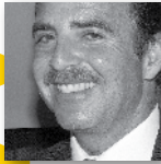
KINSHIP SERVICES: MAINTAINING PRECIOUS FAMILY TIES

“By keeping children within their extended families instead of bringing them into foster care, everyone benefits, especially the children. In what can be a very traumatic situation – being separated from one’s parents – children in kinship care have the comfort of being cared for by relatives who know and love them.”